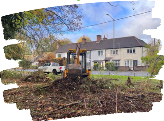
Maintenance of the verge opposite Wooburn Park started in early November, watch this space for progress.