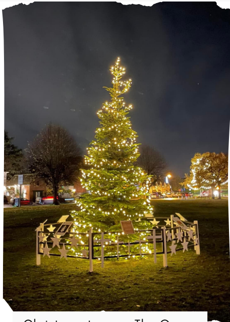
Christmas tree on The Green